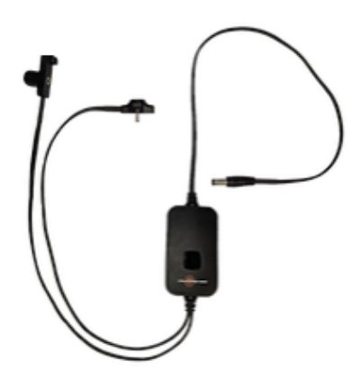
Hybrid Heat Controller - 7V to 12V Converter