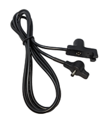
7V Battery 3.5ft Extension