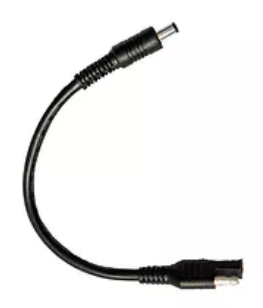
12V SAE to Coax - Male