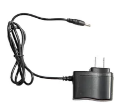
7V Single Battery Wall Charger