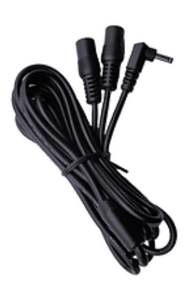
7V Y-Harness Cable