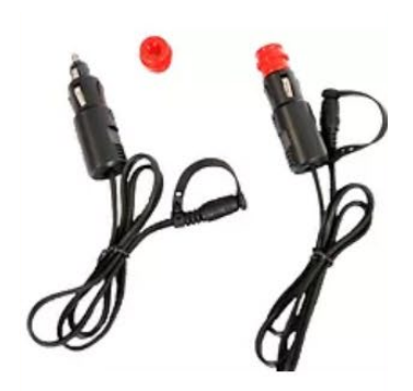
12V Accessory & BMW Plug