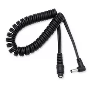
12V - 90° Coil Cord