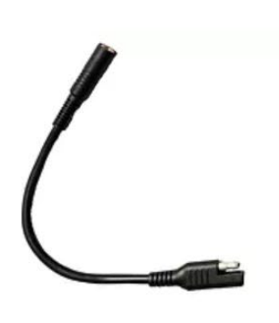
12V SAE to Coax - Female