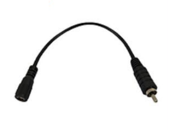
12V RCA to Coax - Female