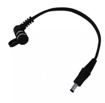
12V Panel Mount Port