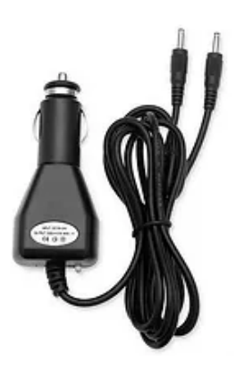
7V Dual Battery Car Charger