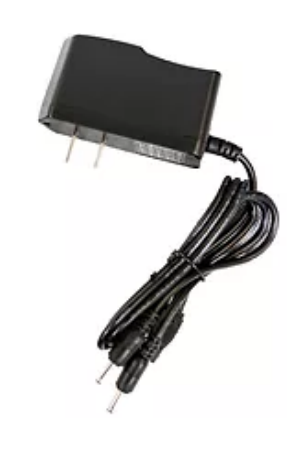
7V Dual Battery Wall Charger