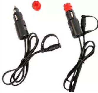
12V Accessory & BMW Plug