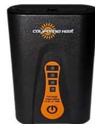
7V Rechargeable Battery - 2500mAh