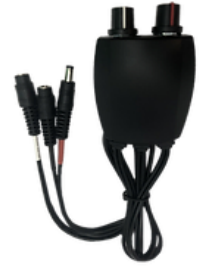
12V Dual Dial Temp Controller