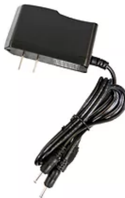
7V Dual Battery Wall Charger