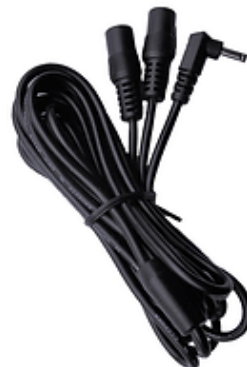
7V Y-Harness Cable