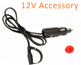
12V Accessory Adapter