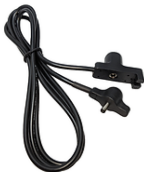
7V Battery 3.5ft Extension