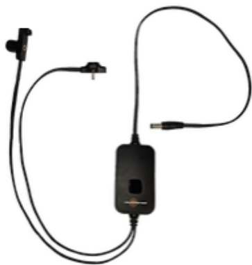
Hybrid Heat Controller - 7V to 12V Converter