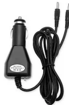
7V Dual Battery Car Charger