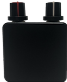
12V Wireless Remote (for Digital Controller)