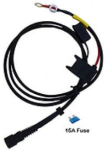
12V Battery Harness