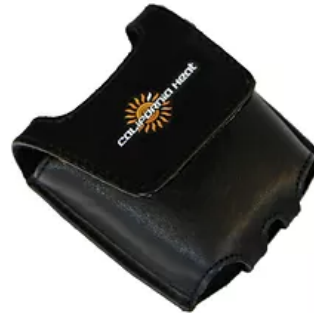
Dual Controller Leather Case