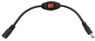
12V Temperature On/Off Switch