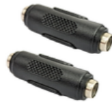
12V Female Adapter Plugs