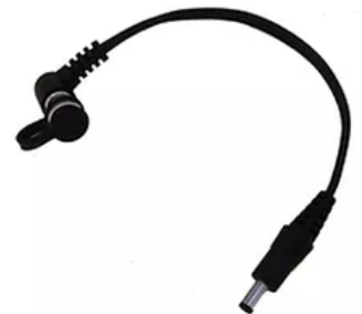
12V Panel Mount Port