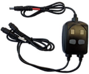
12V Dual Digital Temp Controller