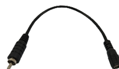
12V RCA to Female Coax