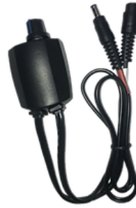
12V Single Dial Temp Controller