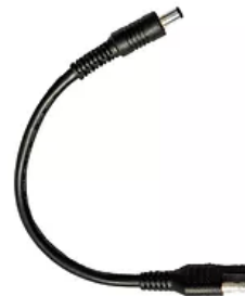
12V SAE to Coax - Male