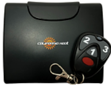
12V Battery - 7000mAh