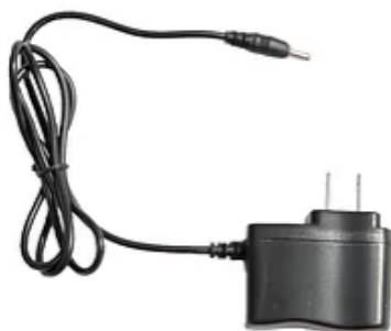
7V Single Battery Wall Charger