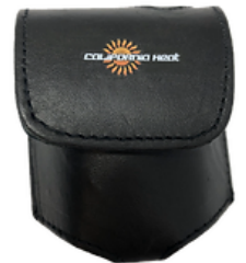
Single Controller Leather Case