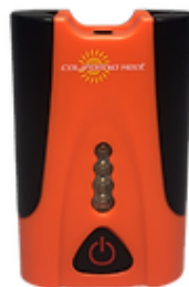
7V Rechargeable Battery - 3500mAh