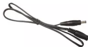
12V - 18" Extension Cable