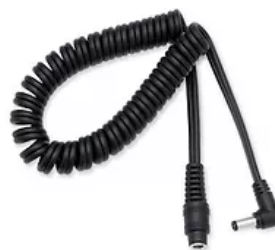
12V - 90° Coil Cord