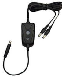
12V Junior Temp Controller [5A Max]