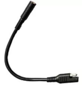
12V SAE to Coax - Female