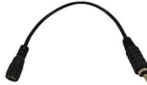
12V RCA to Coax - Female